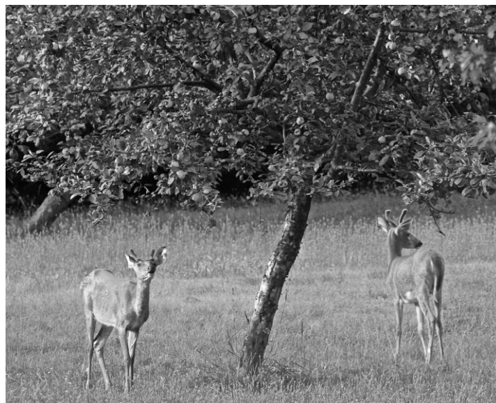
Deer in an apple orchard from Backroad Journal blog

Chinsegut Hill historic site reopens! The Manor House at the Chinsegut Hill Retreat and Museum in Brooksville, Florida, has reopened for tours. During the 1920s, the house played host to Thomas Edison, Helen Keller, Marjorie Kinnan Rawlings, and many others.